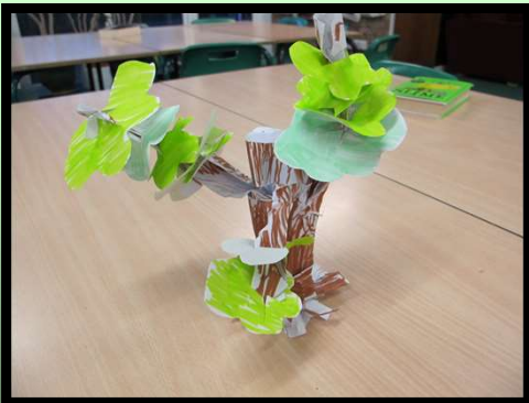
Our Art gallery

KS2 Science competition- Stempoint winners!