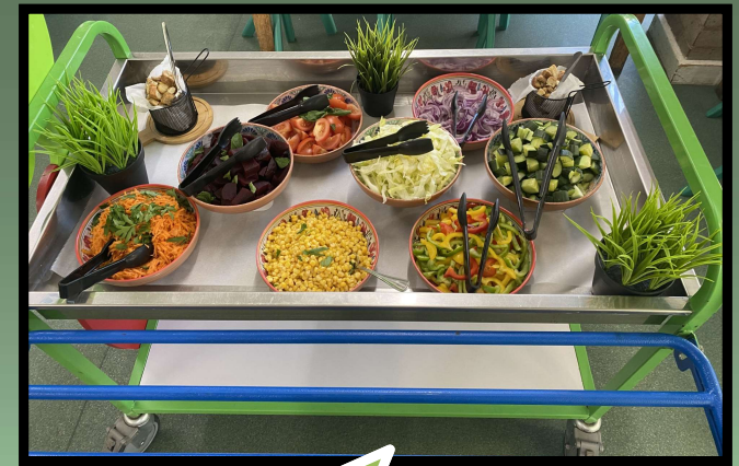
Our salad bar